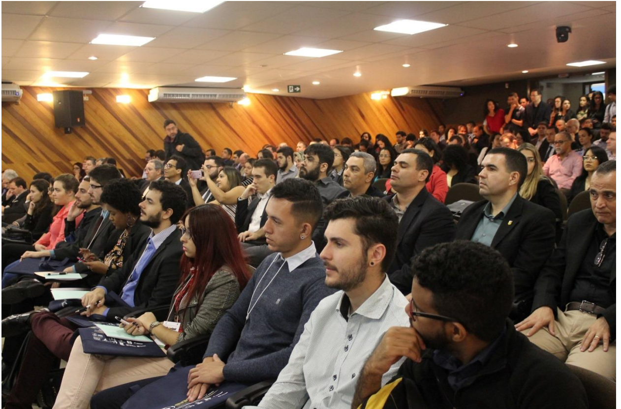
At the opening session of the ENABED. 3 rd of September 2018.

of the meeting there was approximately equal representation of civil and military means, among other things, an existence of a sufficiently powerful barrier to the use of armed forces for anti-democratic purposes. The scope of issues discussed and the high professional level of many subject sections reflects the country's great research potential in the field of security, which should be used as much as possible in solving acute problems of the country. The fact that they are really sharp and require their immediate solution, acknowledged in their papers many ENABED participants.