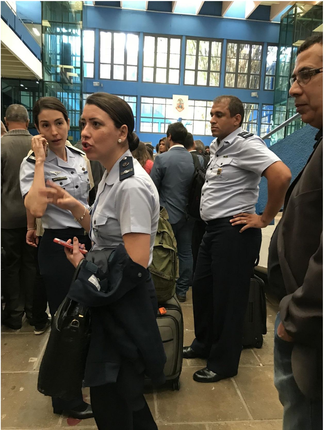
Discussions on the sidelines of the ABED conference.