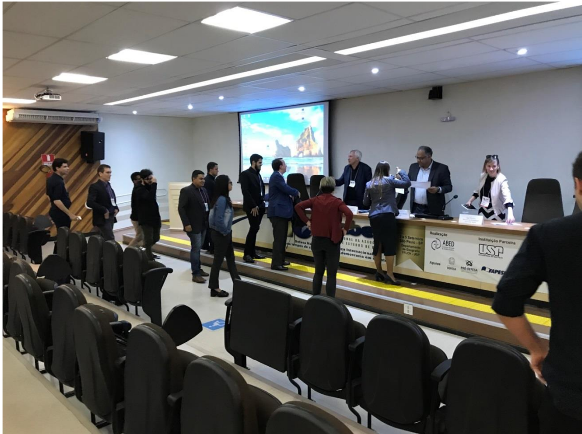
The informal communication after the round table Battlefields, methods and instruments of warfare from the Russian perspective held on 4 th of September 2018 at the ENABED.

Warfare: The Case of Syria by Helmut Augusto Ramírez Braun (Exército do Chile); Representations of Postmodern Warfare in Punk: “Digital Control and Man’s Obsolescence” by Thiago Borne Ferreira (Universidade do Vale do Taquari - Univates). And the role, scope and methods of psychological warfare based on sophisticated technologies there seem practically Terra Incognita if to analyze not only the ENABED materials but Brazilian open sources of information as a whole. That is rather disturbing because the country and the whole world enter the period of long conflicts and bigger global threats that had ever been before inevitably accompanied by hot clashes on the battlefields of HT psychological warfare.