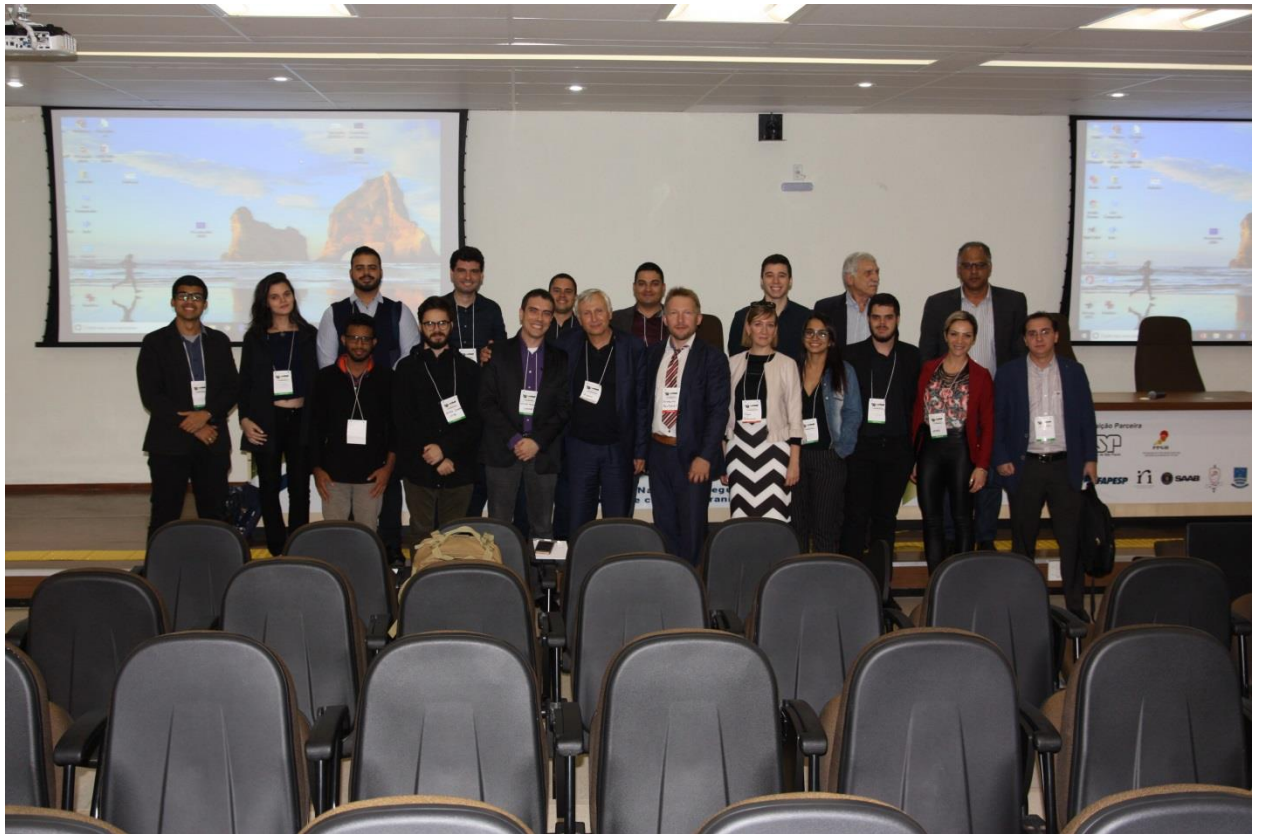
The participants of the round table Battlefields, methods and instruments of warfare from the Russian perspective held on 4 th of September at the ENABED.