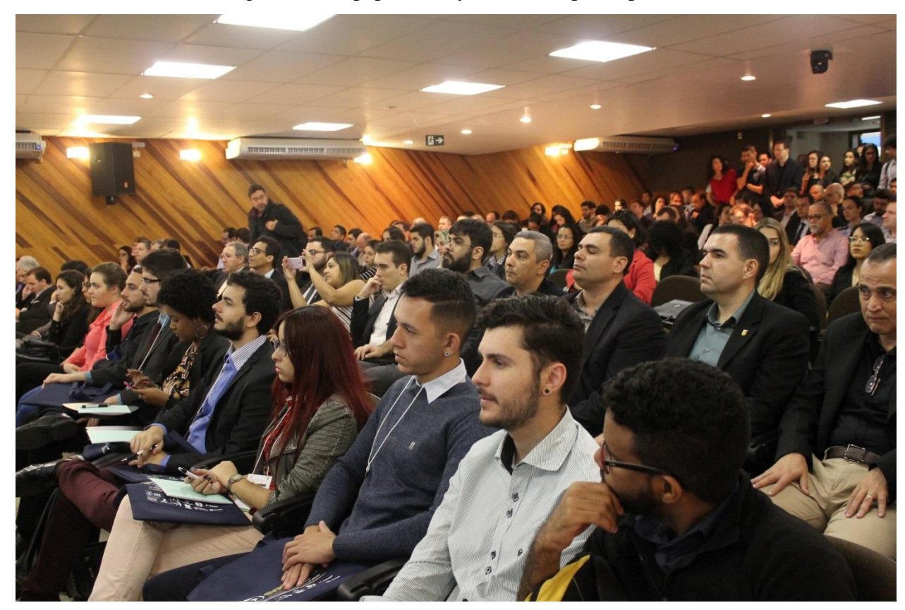
At the opening session of the ENABED. 3<sup>rd</sup> of September 2018.

of the meeting there was approximately equal representation of civil and military means, among other things, an existence of a sufficiently powerful barrier to the use of armed forces for anti-democratic purposes. The scope of issues discussed and the high professional level of many subject sections reflects the country's great research potential in the field of security, which should be used as much as possible in solving acute problems of the country. The fact that they are really sharp and require their immediate solution, acknowledged in their papers many ENABED participants.