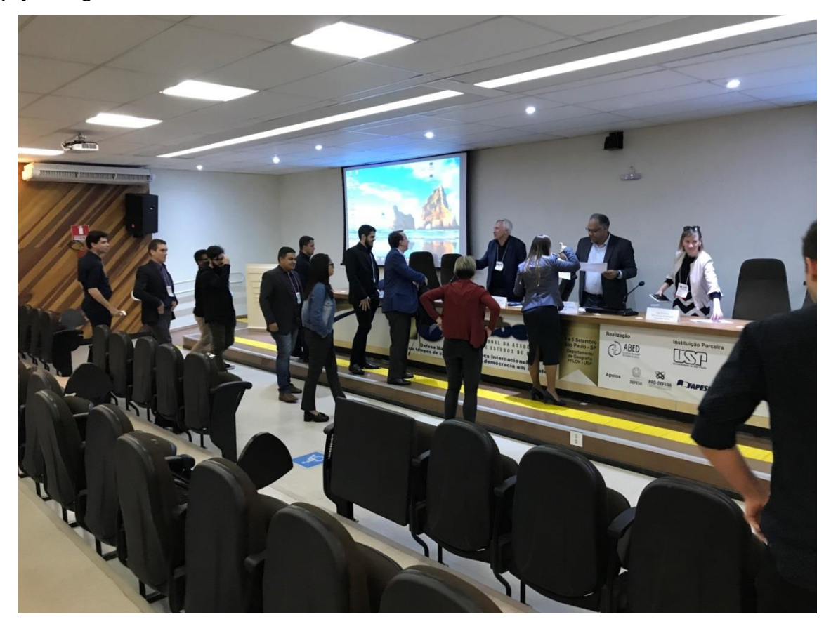
The informal communication after the round table Battlefields, methods and instruments of warfare from the Russian perspective held on 4<sup>th</sup> of September 2018 at the ENABED.

Warfare: The Case of Syria by Helmut Augusto Ramírez Braun (Exército do Chile); Representations of Postmodern Warfare in Punk: "Digital Control and Man's Obsolescence" by Thiago Borne Ferreira (Universidade do Vale do Taquari - Univates). And the role, scope and methods of psychological warfare based on sophisticated technologies there seem practically Terra Incognita if to analyze not only the ENABED materials but Brazilian open sources of information as a whole. That is rather disturbing because the country and the whole world enter the period of long conflicts and bigger global threats that had ever been before inevitably accompanied by hot clashes on the battlefields of HT psychological warfare.